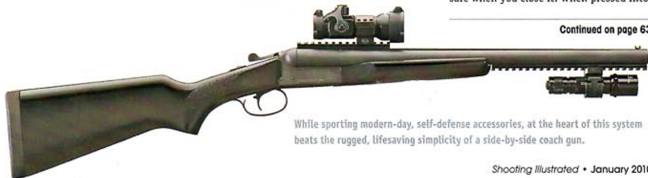
While sporting modern-day, self-defense accessories, at the heart of this system beats the rugged, lifesaving simplicity of a side-by-side coach gun.