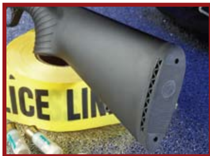
The synthetic buttstock features a 1" thick recoil pad to help absorb the potentially heavy recoil of the lightweight 3½" chambered P-350 Defense.