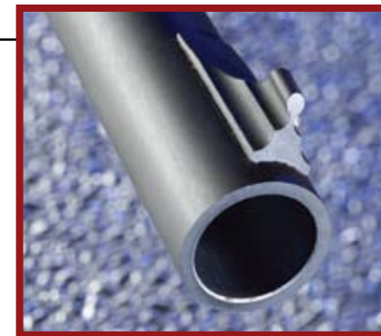
The thick-walled barrel of the P-350 Defense sports a fixed Cylinder Bore choke and a tall blade-style front sight.

The P-350 Defense takes advantage of this characteristic, albeit in a much more compact, tactically oriented package. The result is a defensive-style pump-action shotgun that is capable of firing not only 2¾-inch and 3-inch shells, but also full-length 3½-inch shells. In this department, the P-350 Defense has few peers in the law enforcement shotgun market (apart from rare examples such as its