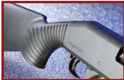
The curved pistol grip of the P-350 Defense features generous molded-in grasping grooves. The action release lever is in its forward portion of the triggerguard.